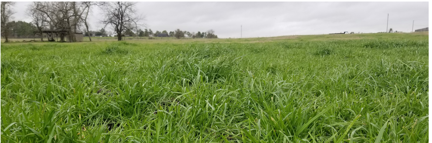
Annual Ryegrass Field

Plateau AgResearch and Education Center , Crossville, TN, 2018